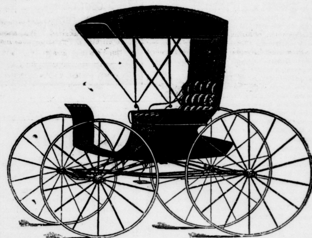
The Comfortable Bangor Buggy.

Perhaps one of the most serviceable and comfortable single Carriages built. Rides as easy as a cradle. Not too heavy and as light as you want it made.