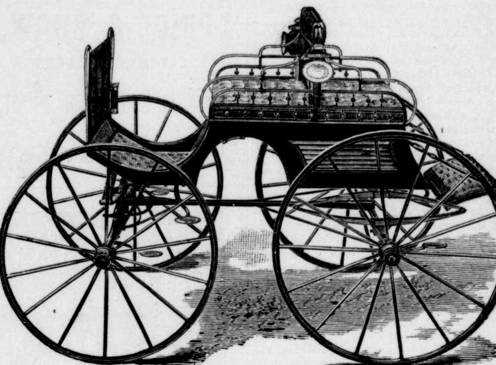
A Stylish Dog Cart. Will carry Two or Four with comfort.