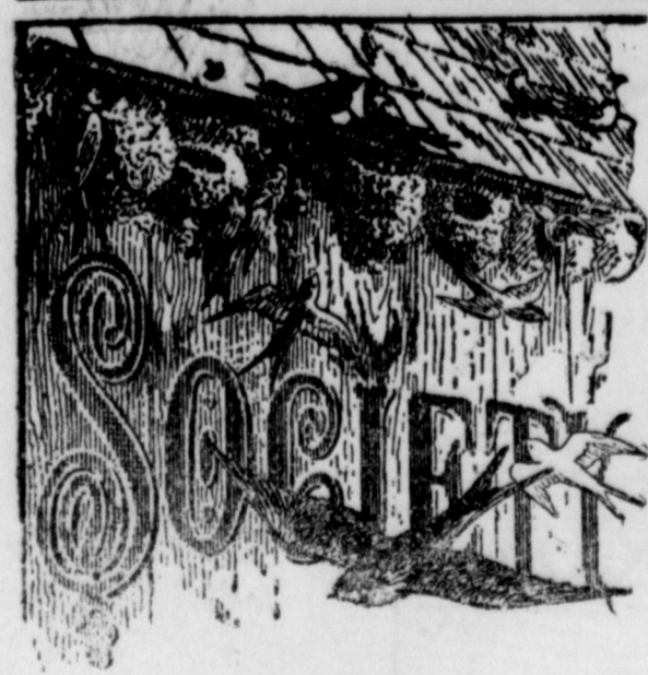
(CONTINUED FROM FIFTH PAGE.)