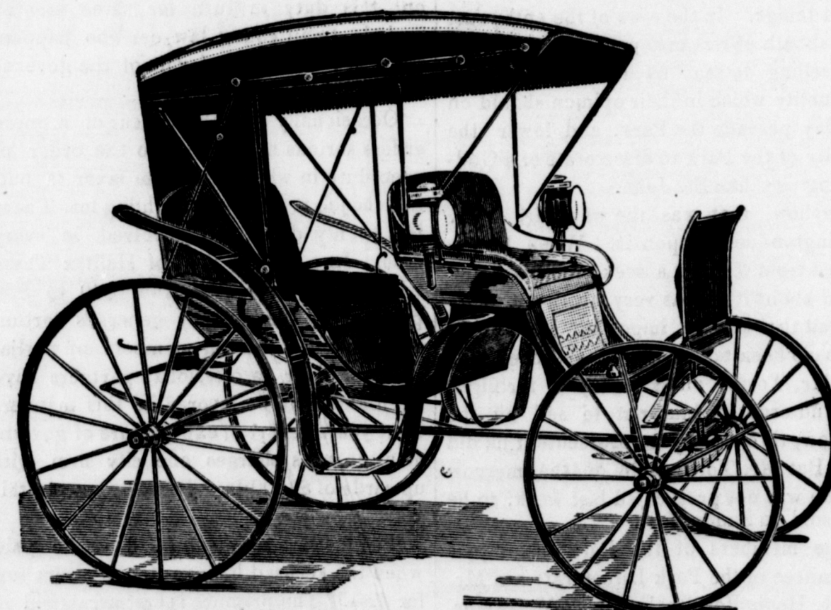
AN ELEGANT EXTENSION TOP BUGGY.

A very handsome and fashionable carriage for family purposes