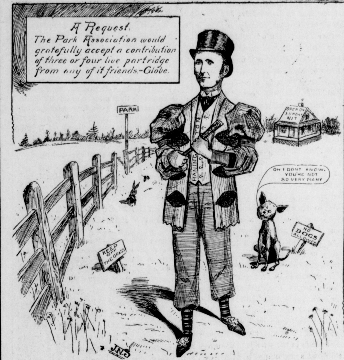
"All I Want is Ma Chickens, Ma Lovely Chickens."