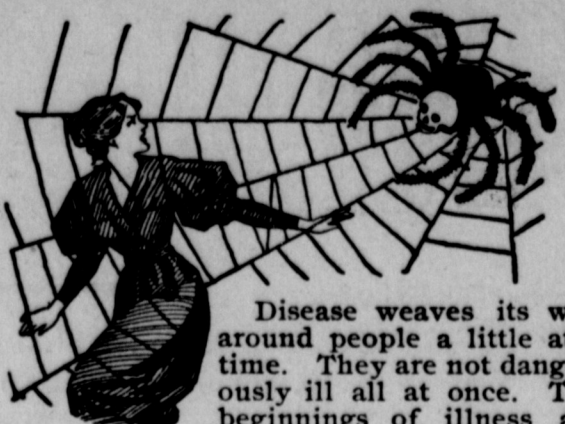
Disease weaves its web around people a little at a time. They are not dangerously ill all at once. The beginnings of illness are mere trifles.

Every package guaranteed. The 5 lb Carton of Table Salt is the neatest package on the market. For sale by all first class grocers.