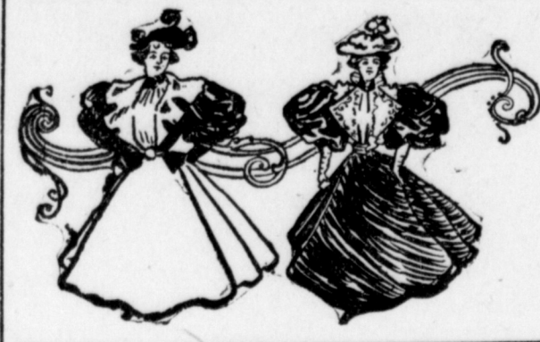
can straw, tuscan lace, tuscan ribbon, silk, etc., is sure to have a big run.

Speaking, or rather writing of the newest shades and tints it seems as if old rose is to be a leader. This rich, subdued shade is finding its way to a large proportion of the spring hats. Tuscan, that deep cream color found so much in the heavier laces, is to rival old rose, and tus-