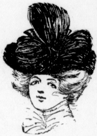
Toque with plisse chignon, braid and bow of chignon. Entire brim and bow of chignon.

On Tuesday, Wednesday and Thursday of this week the big wholesale millinery houses, Messrs. Manchester, Robertson & Allison; Brock & Patterson, Skinner, Le Blanc & Co., also the retail establishment; the Parisian, held their openings. From Thursday until Saturday Messrs. M. R. & A. held their retail opening, which is having its usual large attendance. The city was full of milliners from every where. Even as early as Saturday last they started to flock into the city and on Monday every train and boat was crowded. Notably among the visiting ladies were several contingents from the sister provinces.