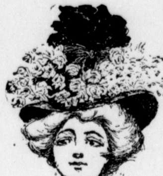
Sailor hat with loosely sprayed wreath of flowers, and chon of velvet fastened to the crown.

(1) Hat with crown of fancy black straw, outside rim of black net and faced with white tulle in very fine folds. Four old rose chrysanthemums are placed at the left side, fastened with a large bow of black and white ribbon.