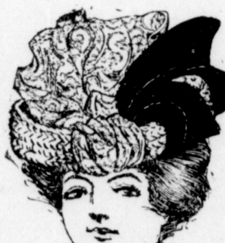
Toque with crown of lace over chiffon, finishing in front with bow and two curving quills.

(8) Large black picture hat of black straw and jet with sequined lace. The trimming consisted of black tulle and white cross ospreys.