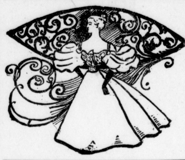
lace predominate among the young fry this summer.

Straw crowns, ruffles, brims, chiffon and