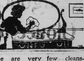
There are very few cleansing operations in which Sunlight Soap cannot be used to advantage. It makes the home bright and clean.