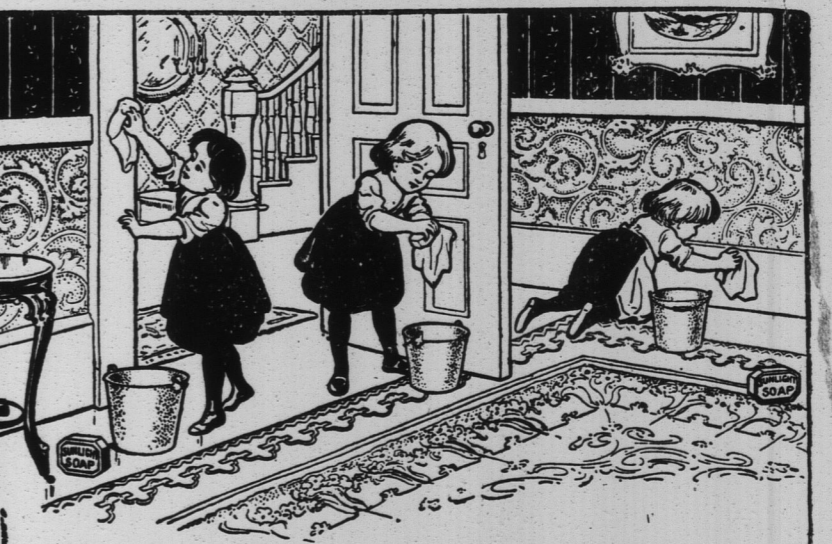
Dirty woodwork or any other part of the house that requires cleaning can best be cleaned by using