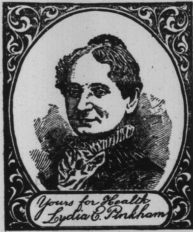
Lydia E. Pinkham's Vegetable Compound is a positive cure for all those painful ailments of women. It will entirely cure the worst forms of Female Complaints, all Ovarian troubles, Inflammation and Ulceration, Falling and Displacements of the Womb and consequent Spinal Weakness, and is especially adapted to the Change of Life . Every time it will cure.

Backache. It has cured more cases of Lencorhos than any other remedy the world has ever known. It is almost infallible in such cases. It dissolves and expels Tumors from the Uterus in an early stage of development. That