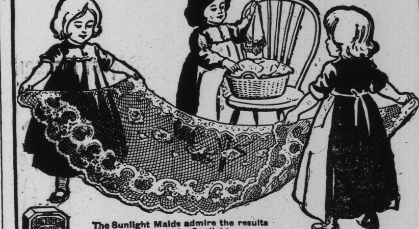
The Sunlight Maids admire the results after washing the Sunlight way.

5c. FIVE CENTS 5c. LEVER BROTHERS LIMITED, TORONTO