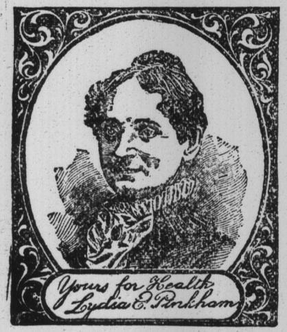
Lydia E. Pinkham

This remarkable woman, whose maiden name was Estes, was born in Lynn, Mass., February 9th, 1813, coming from a good old Quaker family. For some years she taught school, and became known as a woman of an alert