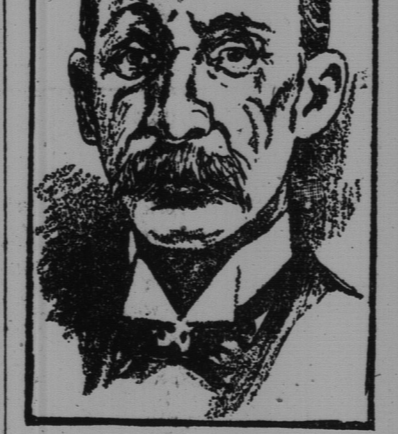
BARON KOMURA, Japanese minister of foreign affairs and the chief of the delegation of plenipotentiaries sent by the Mikado's government to meet the Russian envoys in this country in an effort to arrange peace terms.

The members of both the Russian and the Japanese missions were ready about the hotel and with the exception of M. Witte and Baron Rosen, breakfasted in the main dining room. As several of the Russians were coming out of the dining room this morning they met two of the Japanese entering.