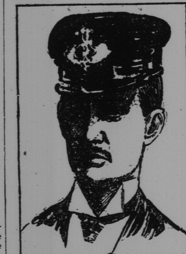
PRINCE CHARLES OF DENMARK.