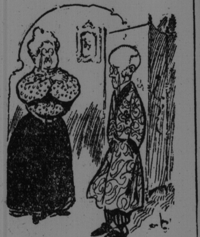
FOILED. Mrs. Scruppy—I'd like to dance over your grave, that's what I'd like to do! Scruppy—Well, you never will, I've put a clause in my will requesting my executors to have me buried at sea!