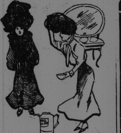
SAME AS USUAL. "How did that rich Mormon who died leave his money?" "He left it to the widows and orphans."