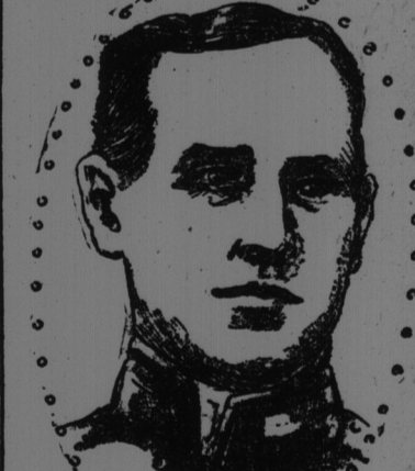
NORWAY'S NEW KING.

CHRISTIANA, Norway, Nov. 18.—Prince Charles of Denmark is now King of Norway and tonight rejoicing is going on throughout the country. At the special session of the Norwegian