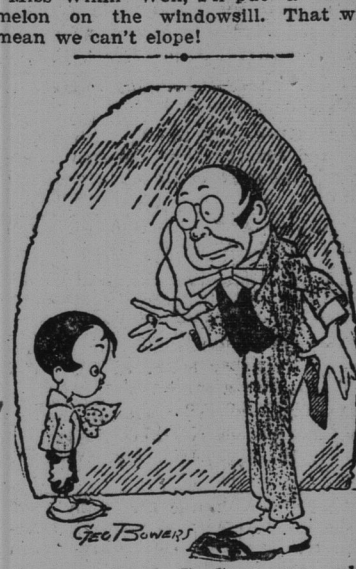
Tommy (aged 7)—Say, pop, what makes a politician great? Mr. Wise—Death.