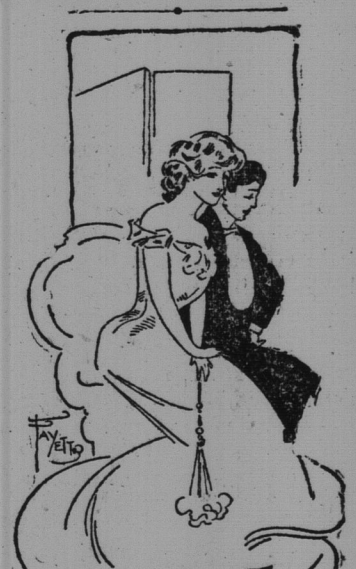
A NOVEL SIGNAL. Fargon—Now, if anything should happen to prevent you trying with me tonight, can you devise a signal that will notify me to that effect? Miss Williams—Well, I'll put a mushmelon on the window sill. That will mean we can't sleep!