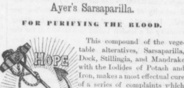
table alteratives, Sarsaparilla Dock, Stillingia, and Mandrake with the Iodides of Potash and Iron, makes a most effectual cure of a series of complaints which are very prevalent and afflicting It purifies the blood, purges our orders. Eruptions of the skin are the appearance on the arface of humours that should be expelled from the

hese same hun.ors to some internal organ, or organs isease and destroy. AYER'S SARSAPARILLA expels these rders they produce disappear, such as Ulcerations of the Liver, Stomach, Kidneys, Lungs, Eruptions and Eruptiv Pimples, Pustales, Blotches, Boils, Tumors, Tetter and Sal Rheum, Scald Head, Ringworm, Ulvers and Sores, Rheuma ism, Neuralgia, Pain in the Bowels, Side and Head, Female Weakness, Sterility, Leucorrhæ arising from internal ulcera ion and uterine diseases, Dropsy, Dyspepsia, Emaciated and General Debility. With their departure health returns