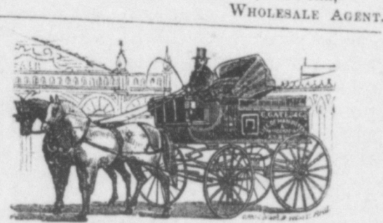
Relief is at Hand!

Sold by all Druggists; price $1, six bottles for $5. A. CHIPMAN SMITH & CO., St. John,