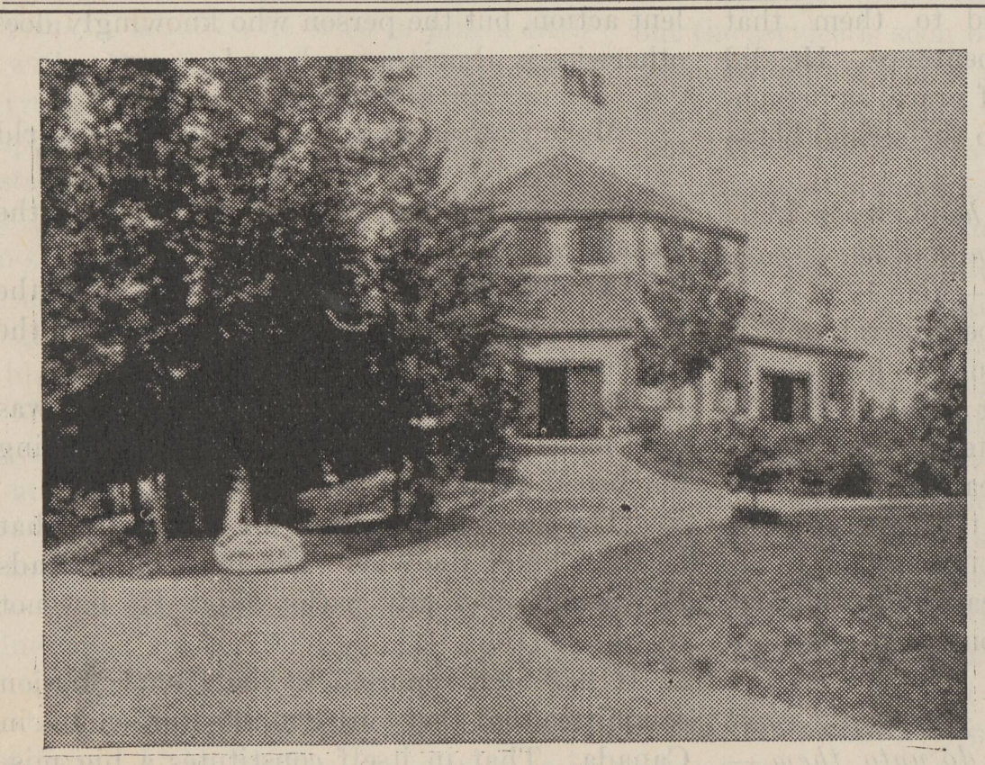
THE TABERNACLE, BEULAH CAMP GROUND.

Let us not forget that life is brief; that time hurries; and that what we do to make our memories of earth beautiful in heaven, and heaven itself more populous than ever, must be done at once."