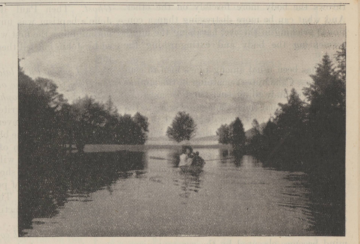
BEAUTIFUL ARTIFICIAL LAKE, BEULAH CAMP GROUND.