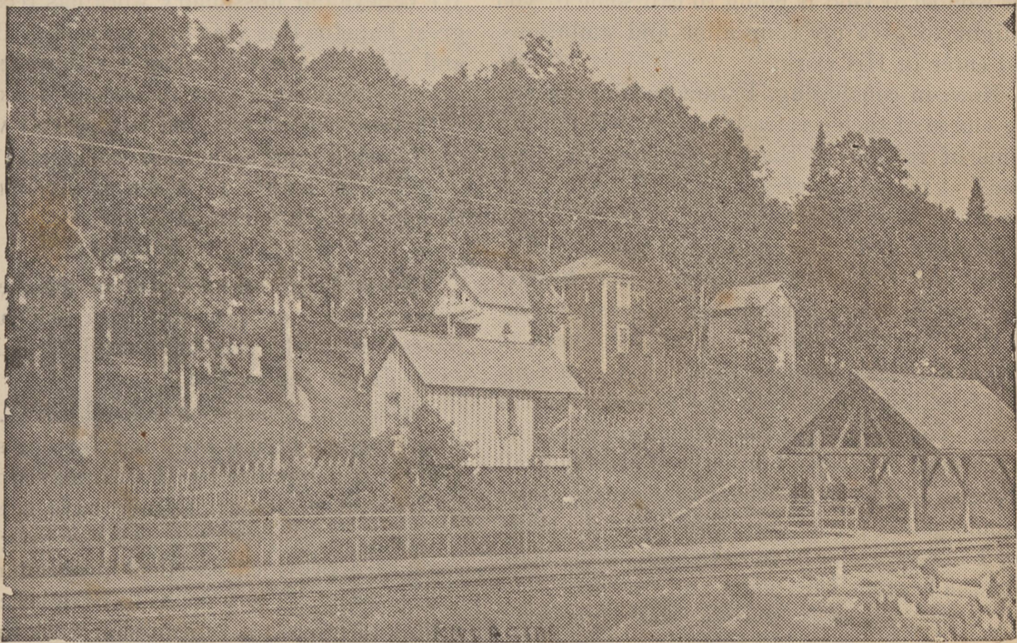
Riverside Camp Ground, near Robinson Station, on the Bangor and Aroostook R. R.