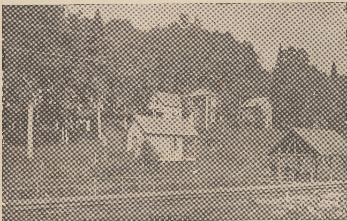
Riverside Camp Ground, near Robinson Station on the Bangor and Aroostook R. R.