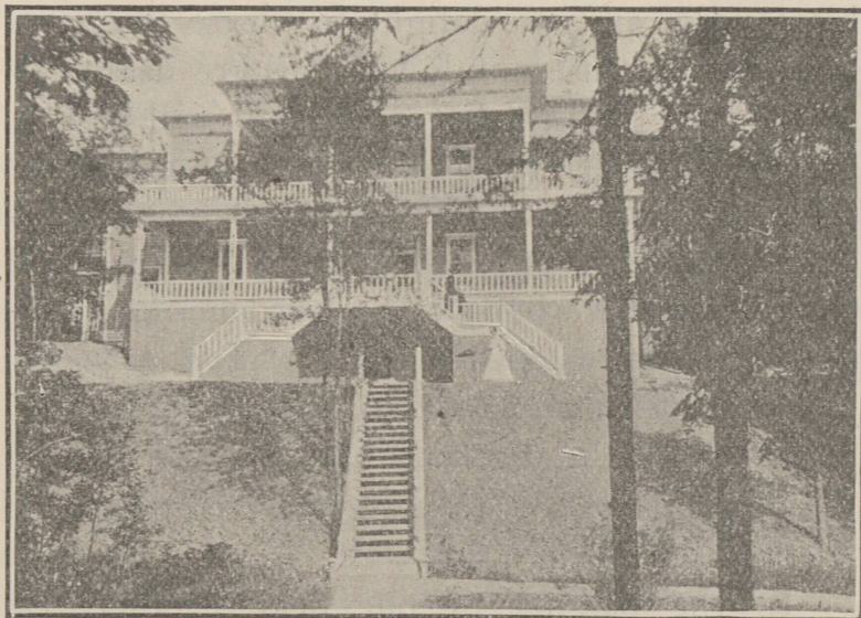
BEULAH CAMP GROUND HOTEL.

The best Camp Meeting Hotel on this continent. Size on the ground—104 x 82 feet. On the first floor there is a dining room, 35 x 82 feet; lunch room, ladies and gents waiting rooms, serving room, store, kitchen, laundry, store room, barber shop, office, telephone booth, and a large balcony.