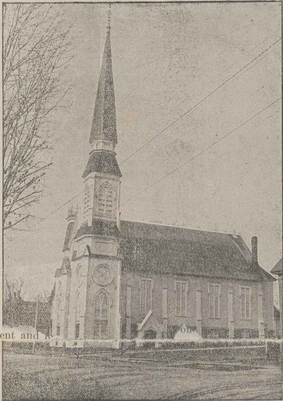
THE WOODSTOCK CHURCH,