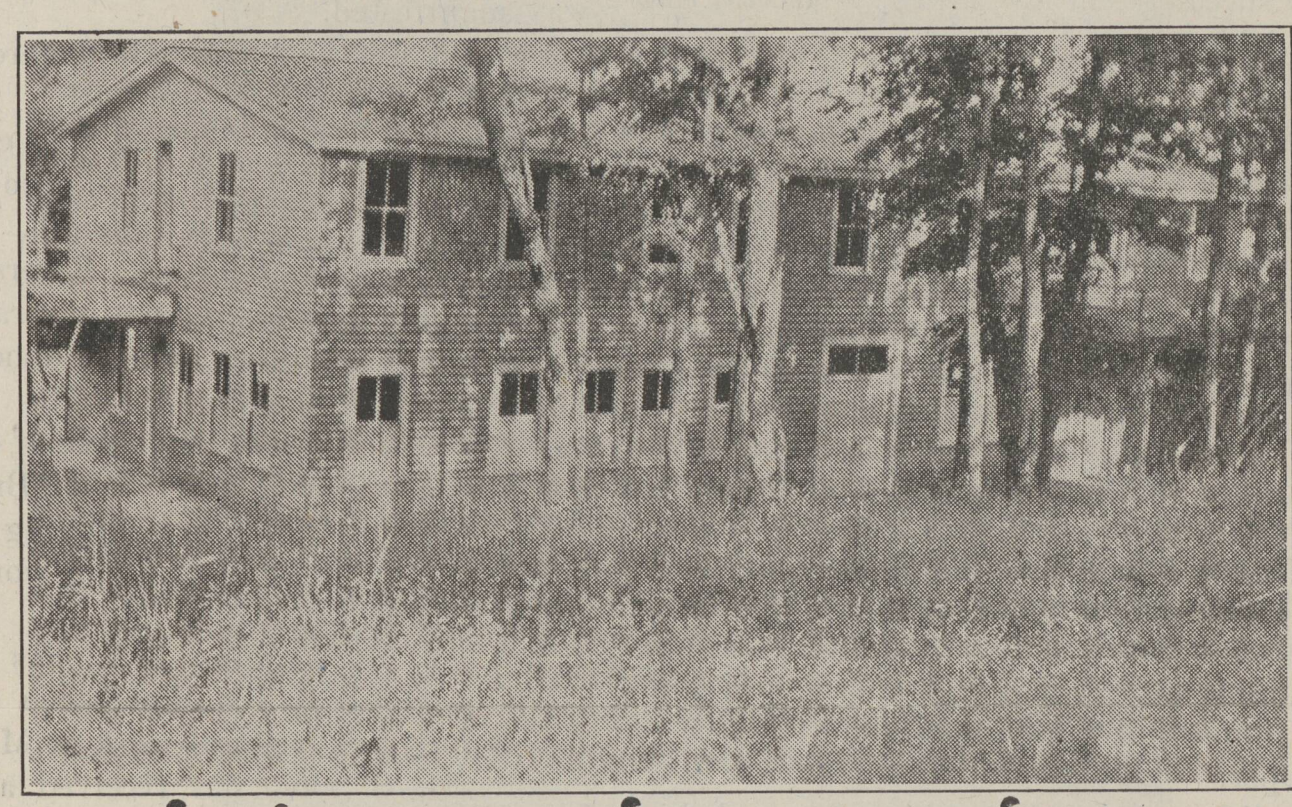
RIVERSIDE CAMP GROUND HOTEL