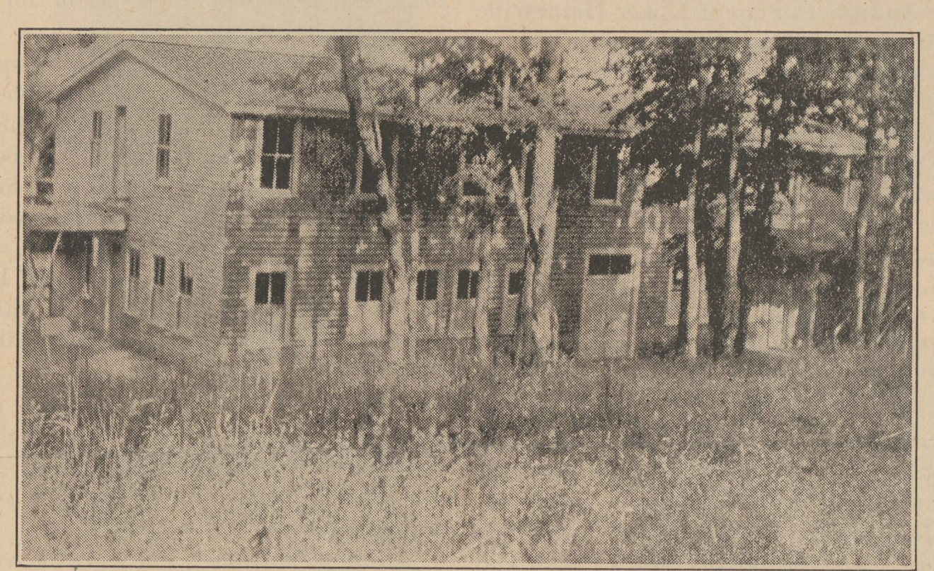
RIVERSIDE CAMP GROUND HOTEL