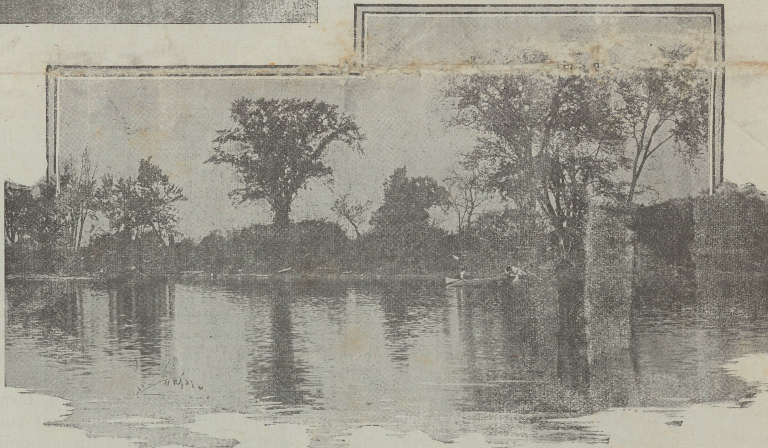
VIEW ON THE NEREPIS, NEAR WESTFIELD.