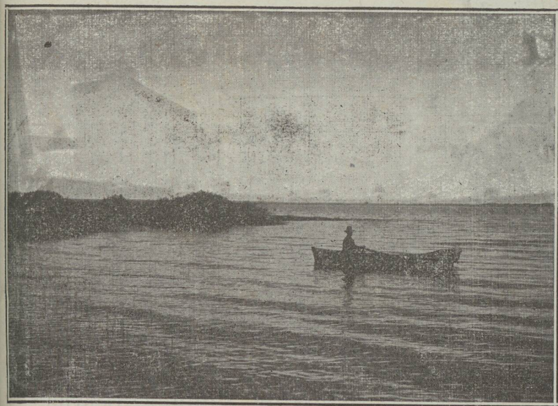
SUNSET ON GRAND LAKE.