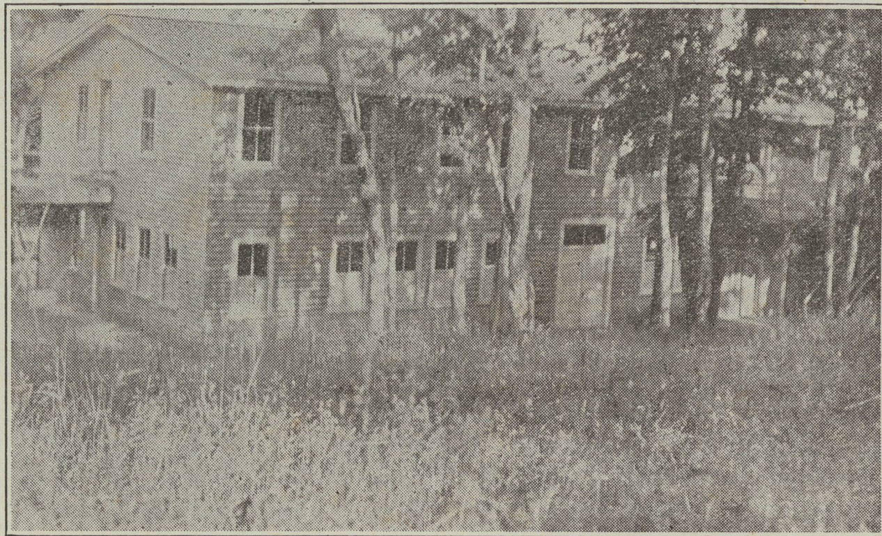
THE RIVERSIDE CAMP GROUND HOTEL.

"All attempts to 'improve' the saloon are like efforts to develop a benign form of tuberculosis and cancer, and a harmless brand of opium. Evil in its character and its consequences, the only logical way to deal with the saloon is to abolish it."