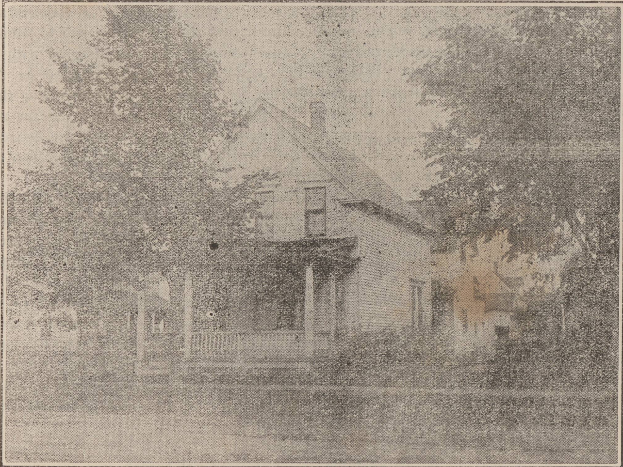
NEW PARSONAGE AT FREDERICTON, N. B.

the nice place for the residence of their pastor and his family. God will honor the faith of his people, and it seems to be God's way with us as a people; when our friends (?) about us begin to say, "their end draweth near." He stirs up our people's faith to undertake new and greater things, and to give new impetus to the