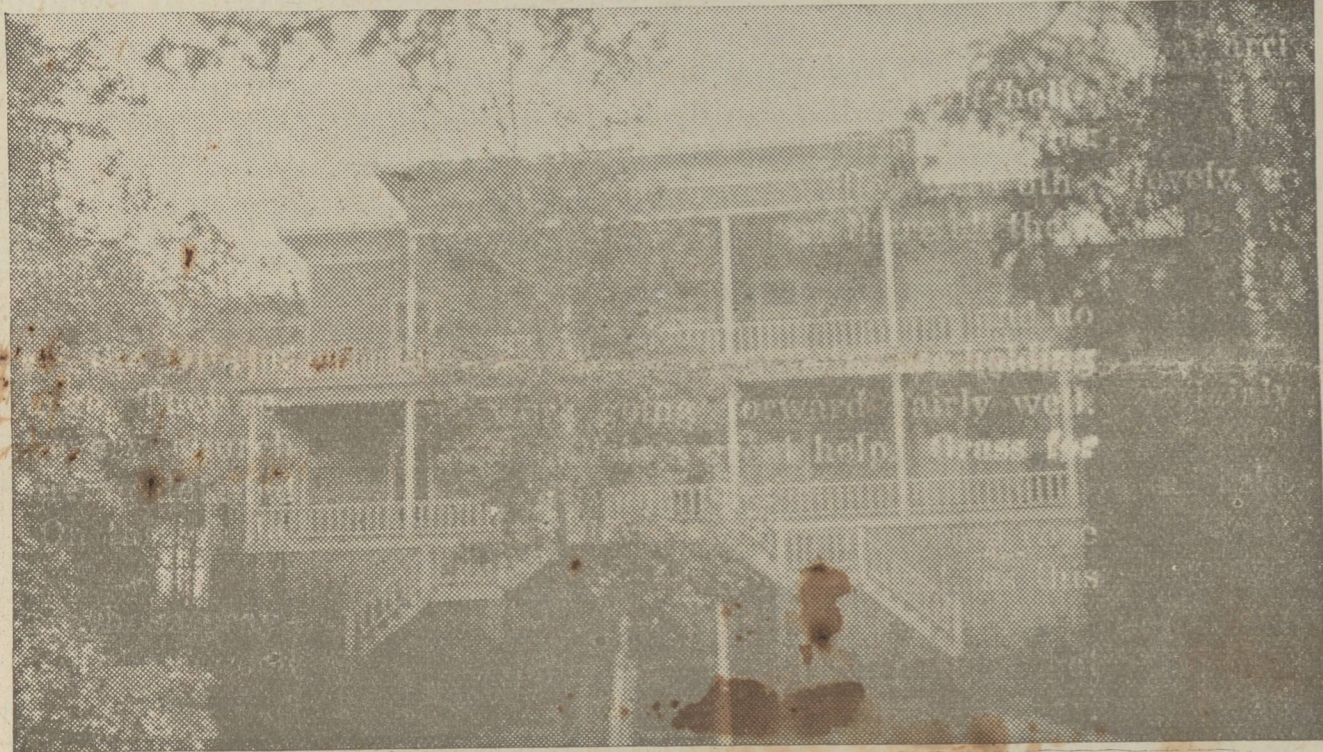
Beulah Camp Ground Hotel.