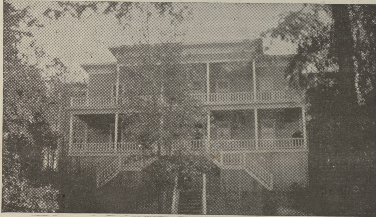
Beulah Camp Ground Hotel.