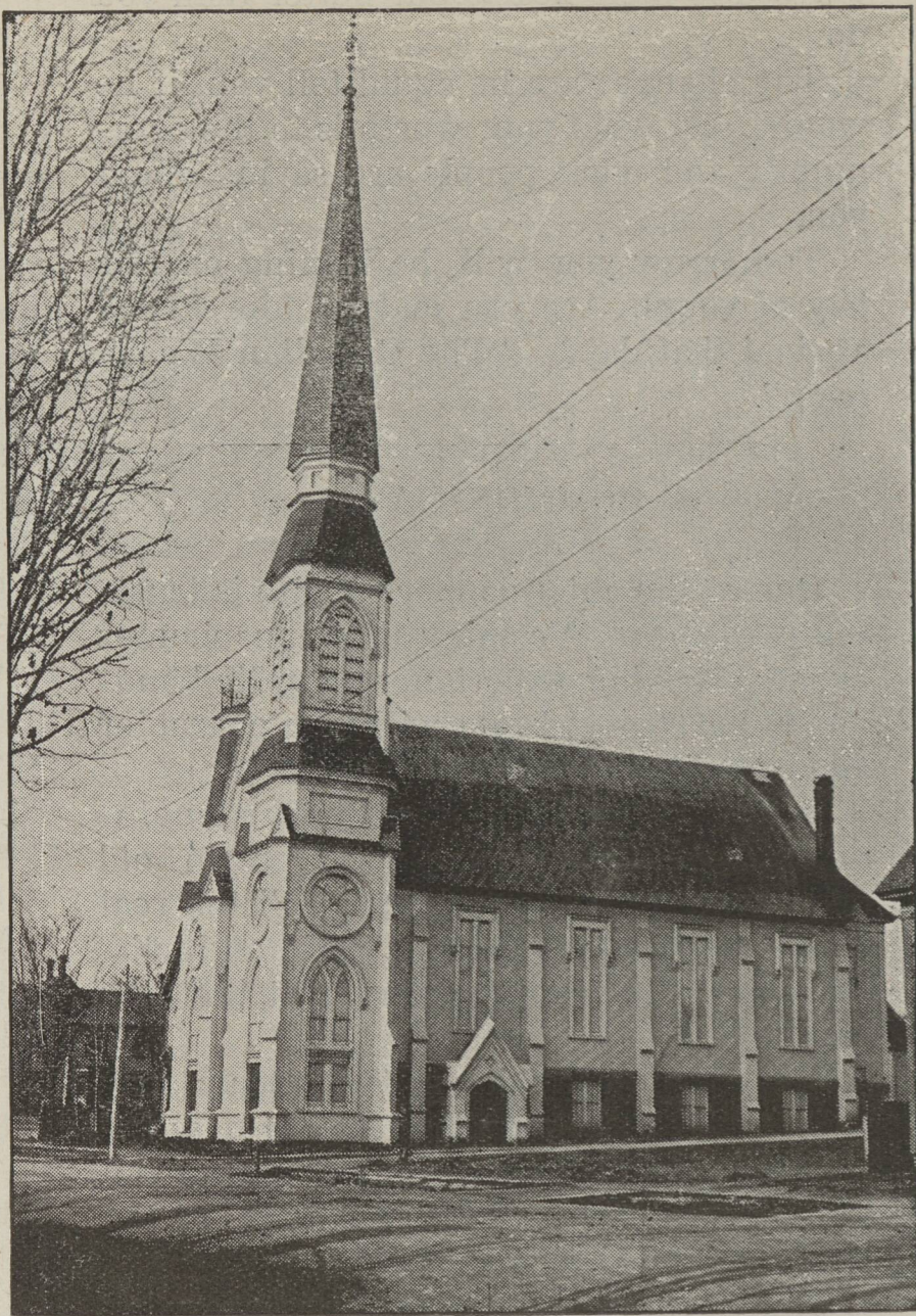
THE WOODSTOCK REFORMED BAPTIST CHURCH The Birthplace of the Reformed Baptist Alliance

Who has held the office of Treasurer from the organization until the present