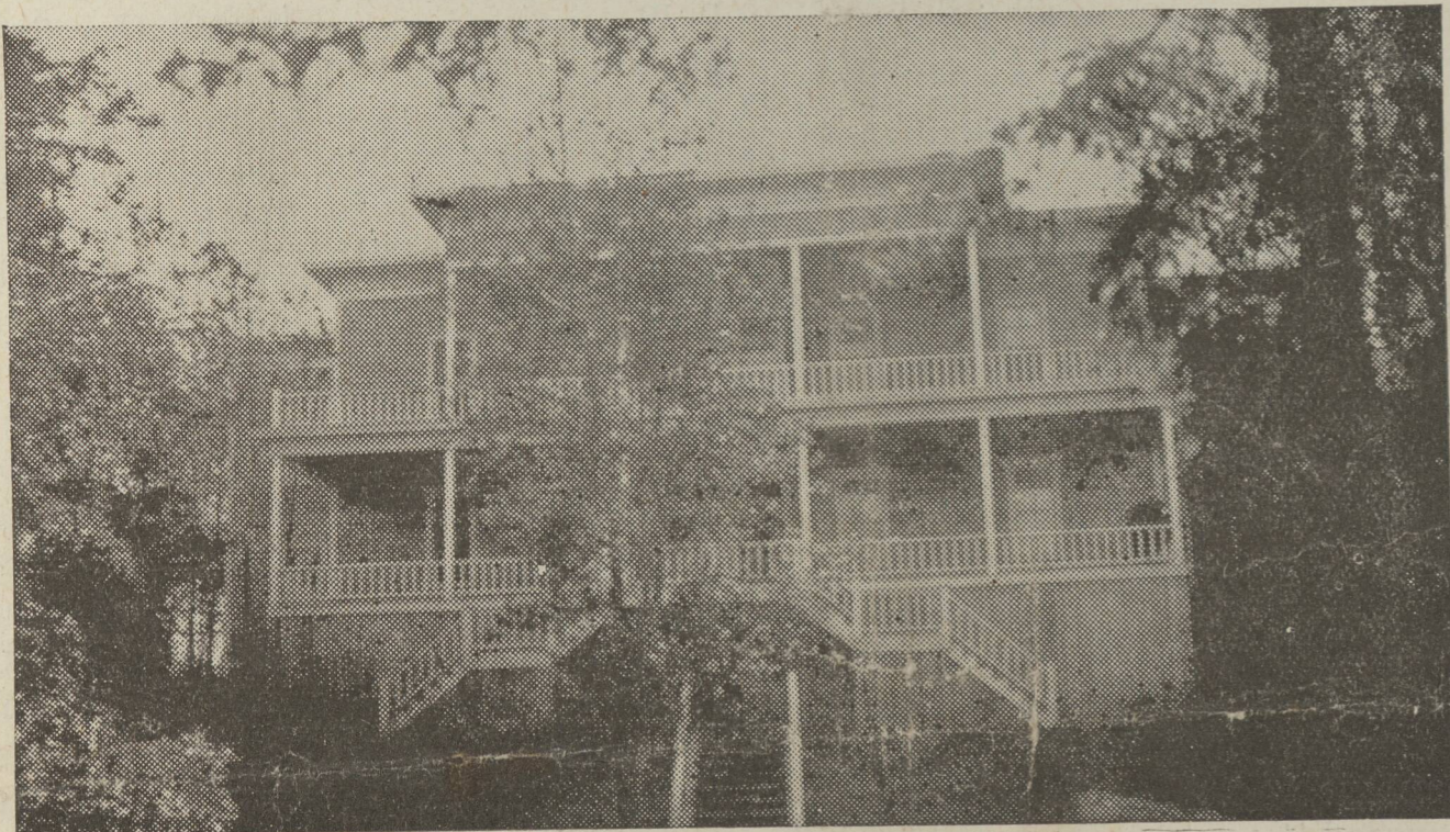
Beulah Camp Ground Hotel.