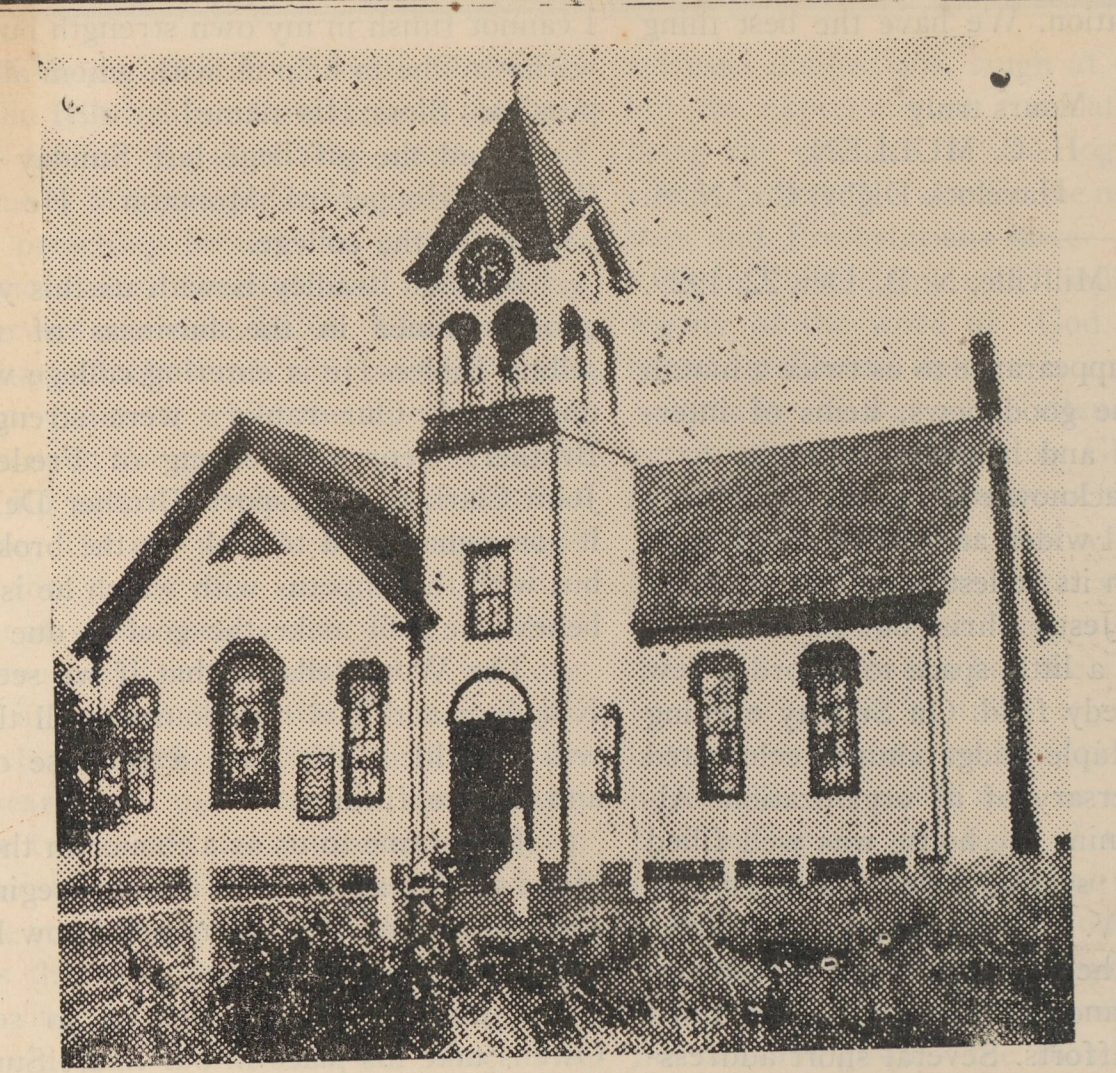
Church at Beals, Me.