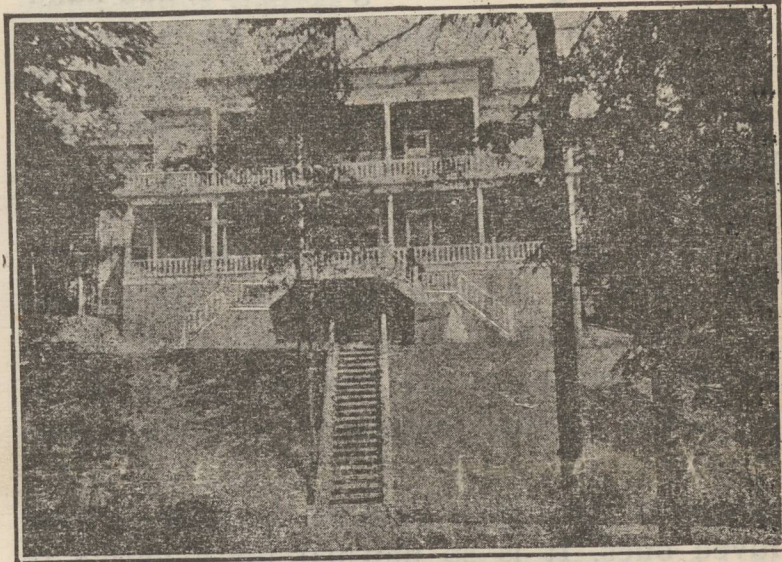
Front of Hotel