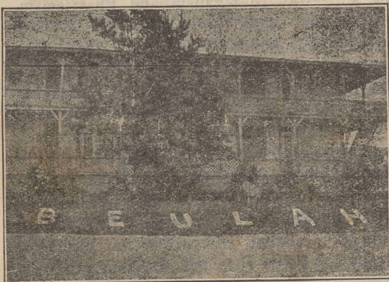
River View Dormitory