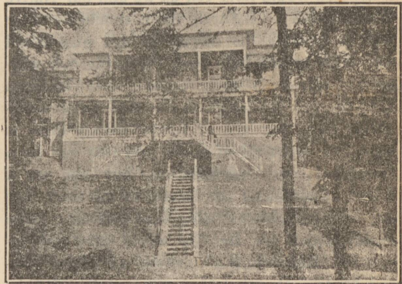
Front of Hotel