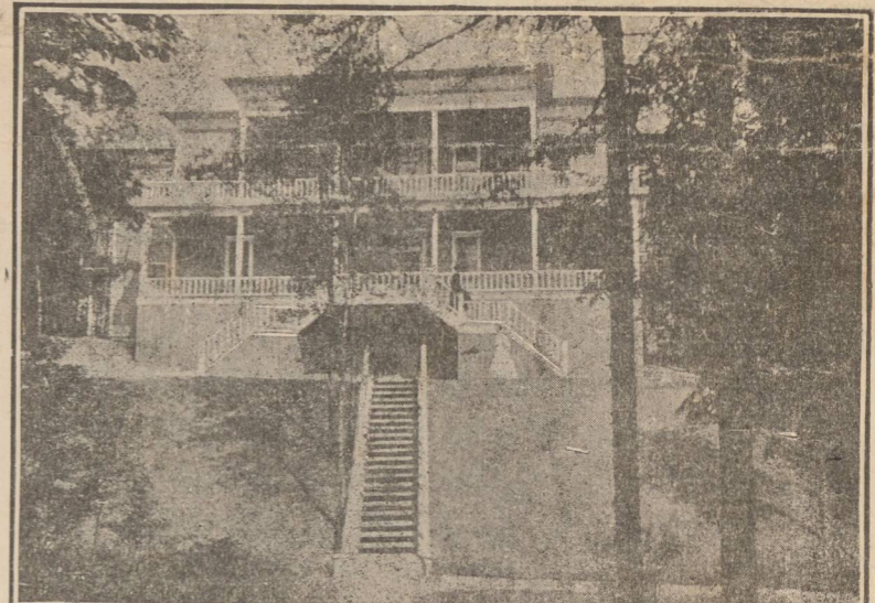
Front of Hotel