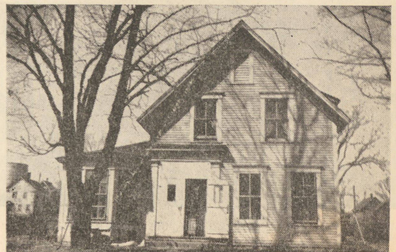
Woodstock R. B. Parsonage

FOR EXTRA COPIES OF THIS SPECIAL NUMBER OF THE HIGHWAY WRITE—