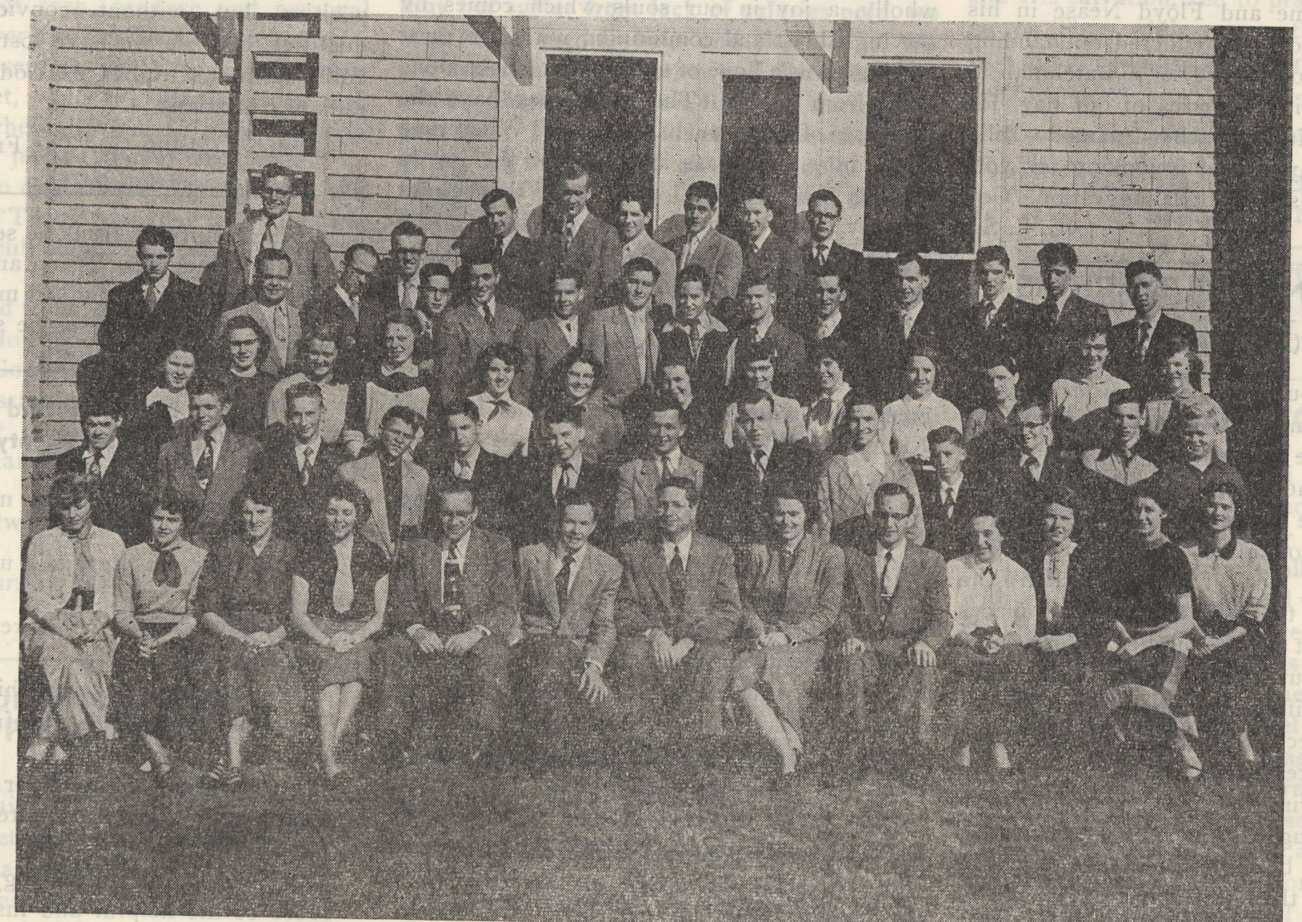
CLASS OF 1954