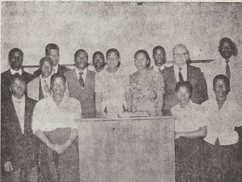
Faculty and Graduates at Evangelical Holiness Bible College