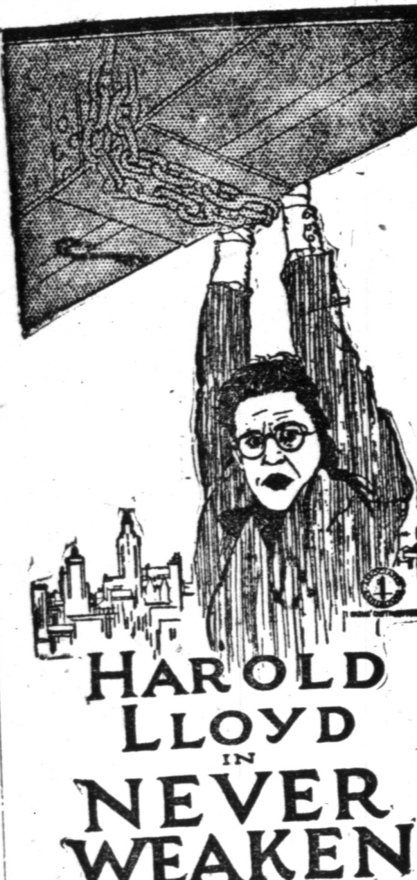
HAROLD LLOYD IN "NEVER WEAKEN"

In the sixth chapter of the path serial, "The Green Archer," showing at the Imperial Theatre, it is shown how Goldharbor Smith, that crafty henchman of the cruel Abel Bellamy, plans to make his fair prisoner, Valerie Howett, his bride. When she attempts to escape—when she slaps his face, beats at him with her fists and then scores him with caustic tongue, he warns her to treat him right, or she'll disappear from sight for twenty years, as Elaine Holding did! Elaine Holding—the woman Valerie seeks—the woman she believes to be yet alive!