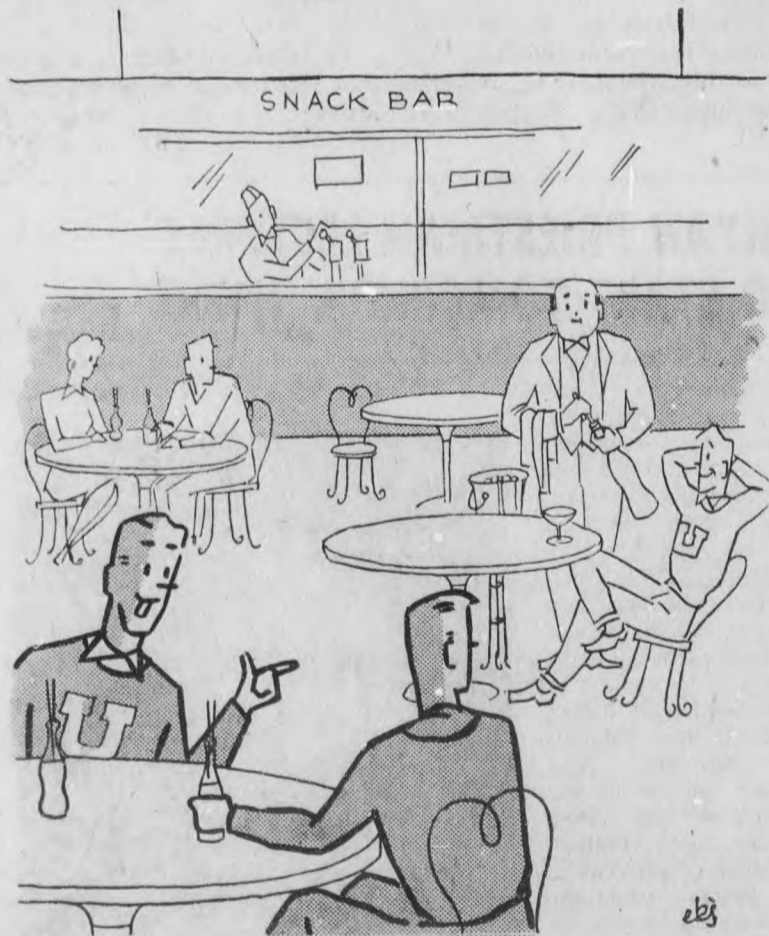
He says he does it by Steady Saving at the Bank of Montreal*