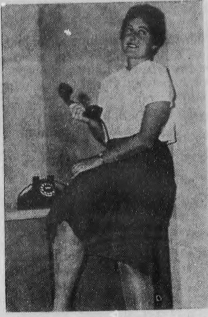
A-h-h, now that the Directory's out . . . ?