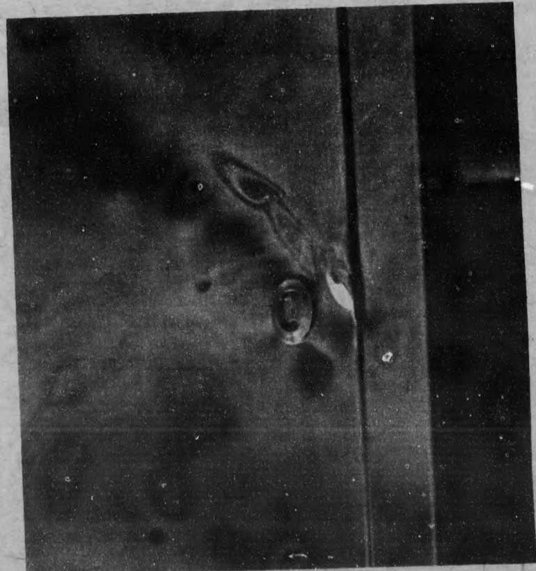
Some clod decided he couldn't get enough paper out of the dispenser, so he smashed and dented it trying to break it open.