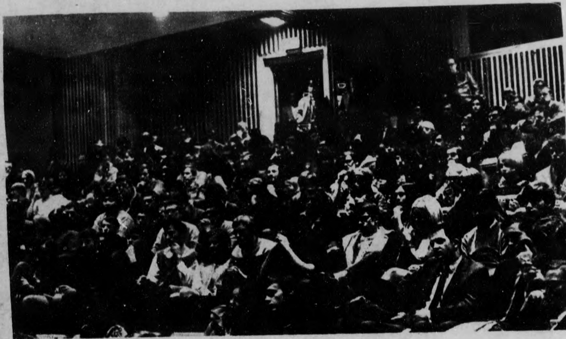
A concerned group of students and faculty gathered for answers in McLaggan Hall Wednesday night at the special SRC meeting. An overwhelming majority of the on-lookers favored immediate dialogue between the SRC and the deans. The SRC came but where were the deans?

"Not to strike would be an implicit acceptance of the board of deans' ability to act in any arbitrary fashion it deems fit; to exist and act as a body responsible only to itself, without recourse to the suggestions and recommendations of the student population and . . . the SRC."