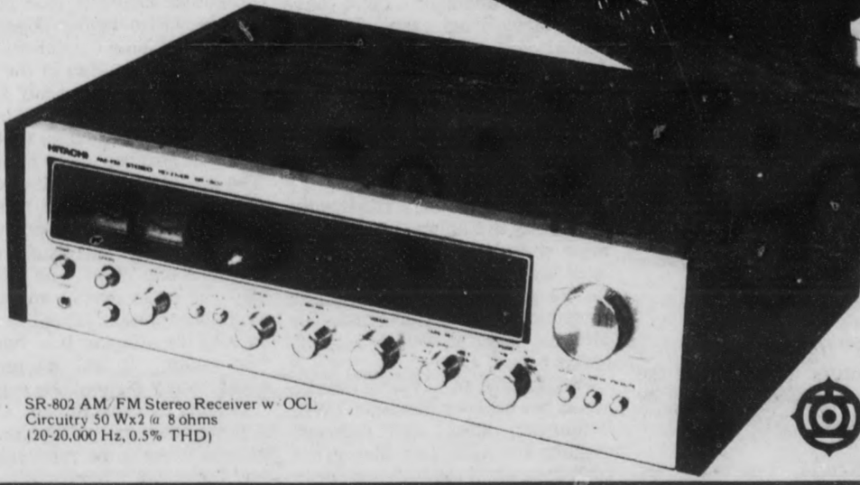
SR-802 AM/FM Stereo Receiver w/ OCL Circuitry 50 Wx2 @ 8 ohms (20-20,000 Hz, 0.5% THD)

The kind of achievement that has made Hitachi a world leader in electronics.