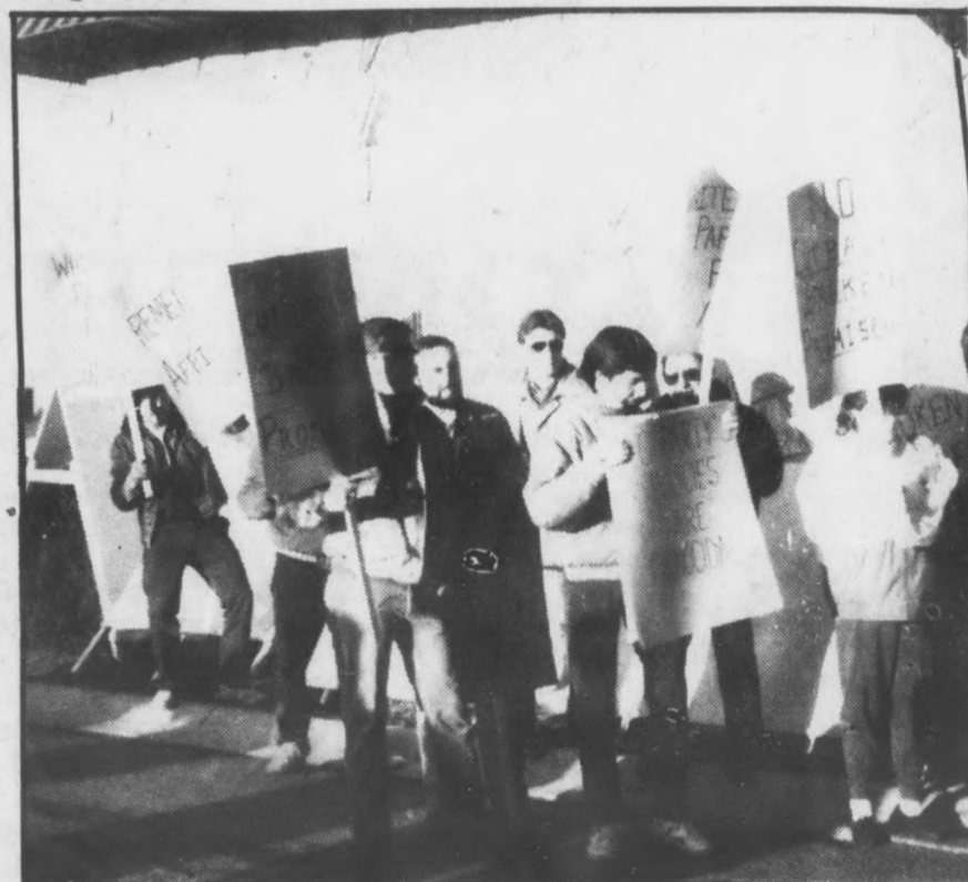
Protesters Picketing Mulroney's Visit Last Week