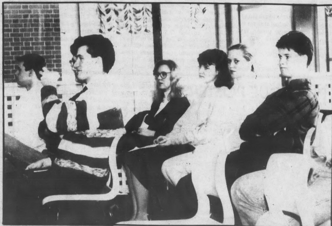
Some of the candidates in the Student Union Elections who spoke to a rather disinterested noontime crowd at Monday's "Meet the Candidates" Forum.

He adds that the "national average (for the AIDS virus) doesn't even come close to that". If it did the Red Cross would be jeopardized in the activities they now perform. In fact, New Brunswick has quite a low average, compared to other places in Canada; especially large metropolitan cities. He doubts that "there was a single person out of that clinic that tested positive for the AIDS virus."