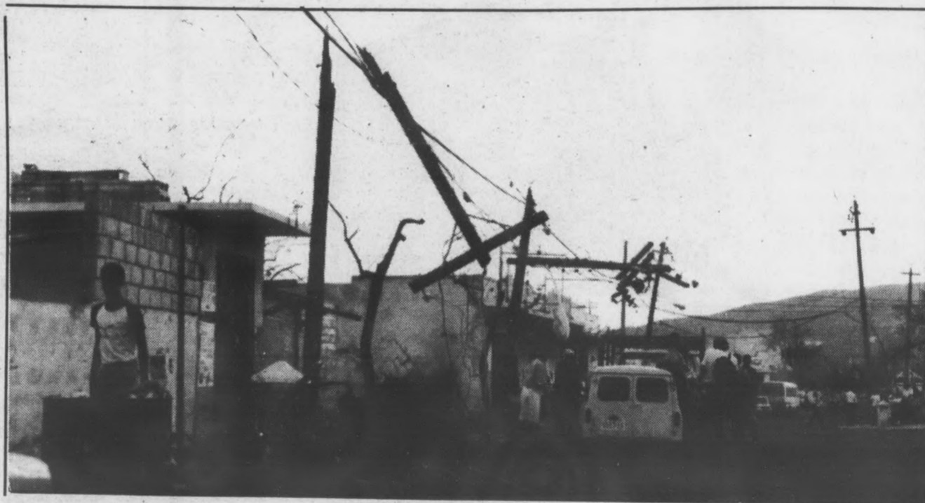
Devastation in Jamaica from Hurricane Gilbert