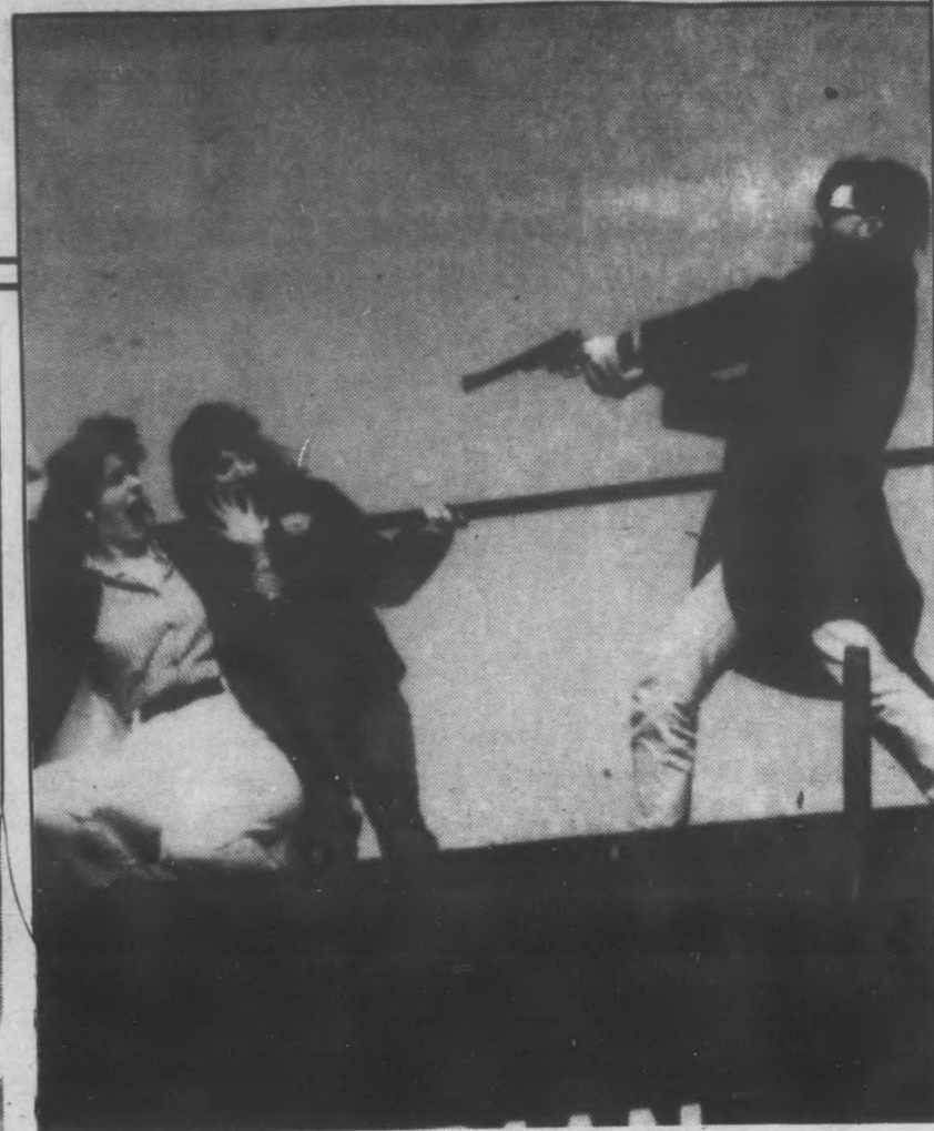
Action shots of the hijack by photographer Pearl Locker. Hijacker's glasses are circled.